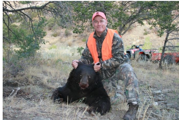
This Trophy Boar topped 500 lbs