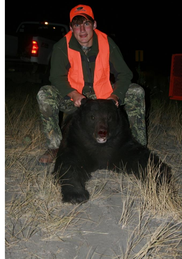
Trophy Boar topped 500 lbs.

wisenhour@lonestarooutfitters.com www.lonestarooutfitters.com